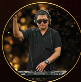
After Party at Rooftop DJ ALLE 11:00 PM - 1:30 AM