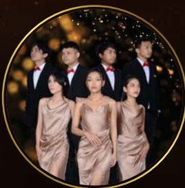
International Party Band ARENBEE BAND 7:00 PM - 10:00 PM